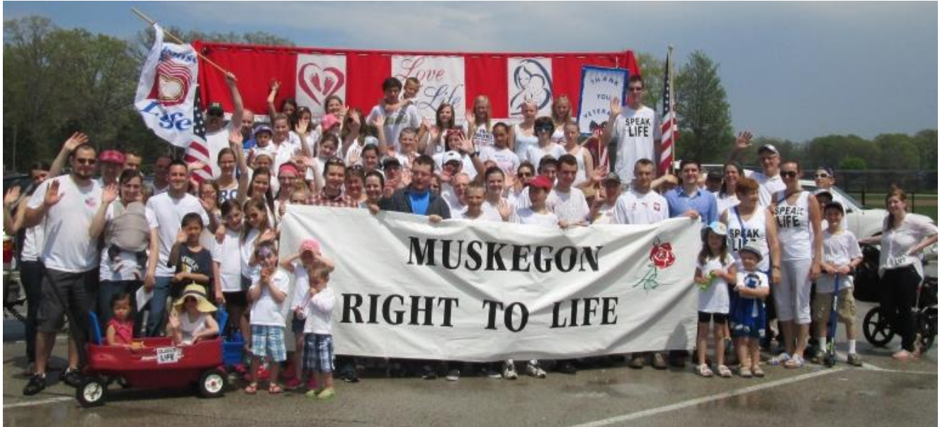
Fruitport Old Fashion Days Parade on Memorial Day

Muskegon County Right to Life News is published by Muskegon County Right to Life 427 Seminole Rd., Suite 108, Norton Shores, MI 49444 231 733-6300 www.muskegonrtl.org