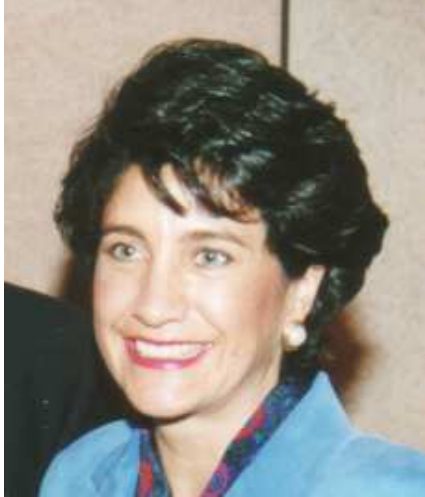
President, NOEL Co-Founder, Silent No More Awareness Campaign